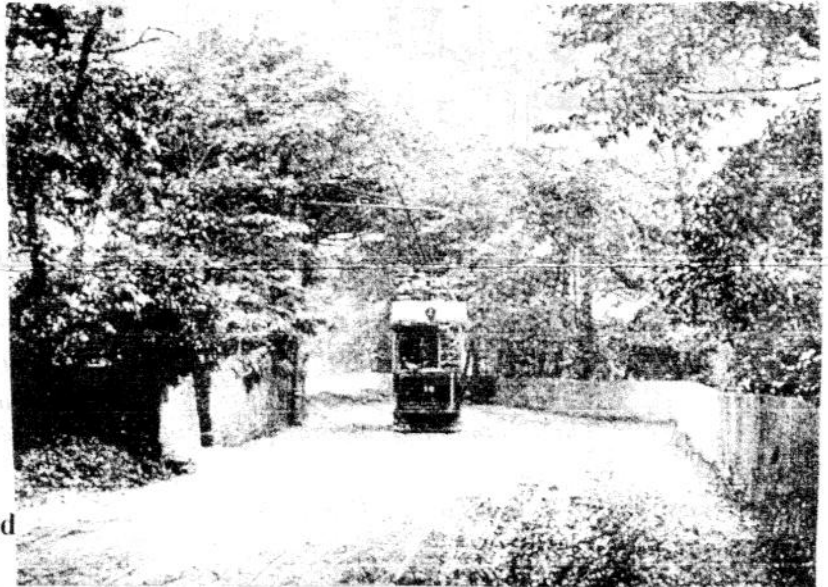
Quaint rural trips along the Ridge in Hastings in those early days

Hastings Tramways Club prepares to commemorate in 2005 the opening of the first electric Tramway in Hastings in 1905-1929 by means of posters, photo's, paintings, model trams, displays, and events. It will give an insight into life at the turn of the last century with the introduction of 'as then' a new means of Transport that ordinary folk could afford. These new trams could take them from the town centre to places as far and as high as the Ridge following the road along to the Harrow Inn at Baldslow then continue down to Silverhill, via (Depot) or proceed further on to either Bohemia Road or London Road St Leonards and then onto the sea front heading towards West Marina Railway station off of Bexhill Road at the Bo-Peep P.H. A year later, Bexhill and as far as Cooden are also reached by the Hastings Tramcars.